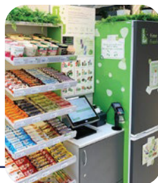
Buildings A, B and C – 1 st floor

The range of assortments includes sandwiches, snacks, ice cream, soft drinks, and dairy products.