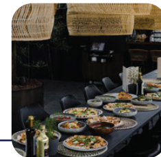
Pizzeria & Restaurant "Aerottoria"